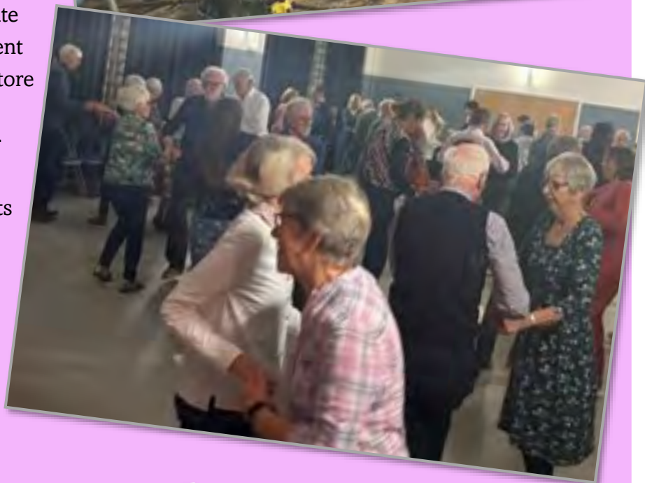
Top: Superb music was supplied by the Malt Whiskers Ceilidh Band.