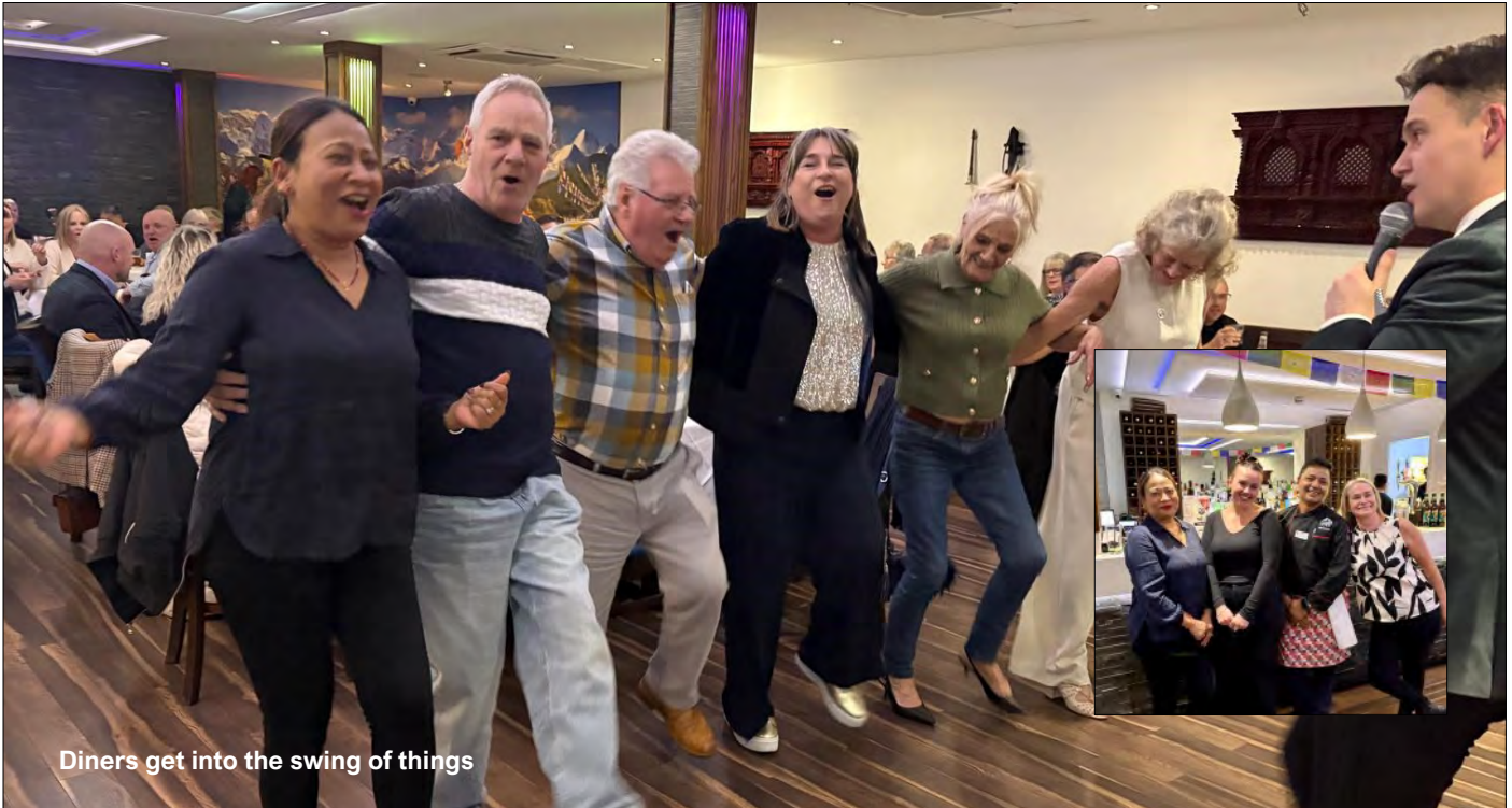
Diners get into the swing of things