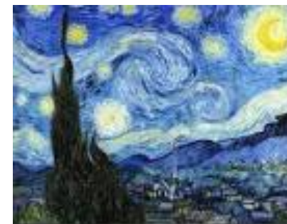
Vincent Van Gogh