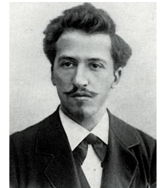
Piet Mondrian 1872-1944 Dutch Pioneer of Abstract Artist