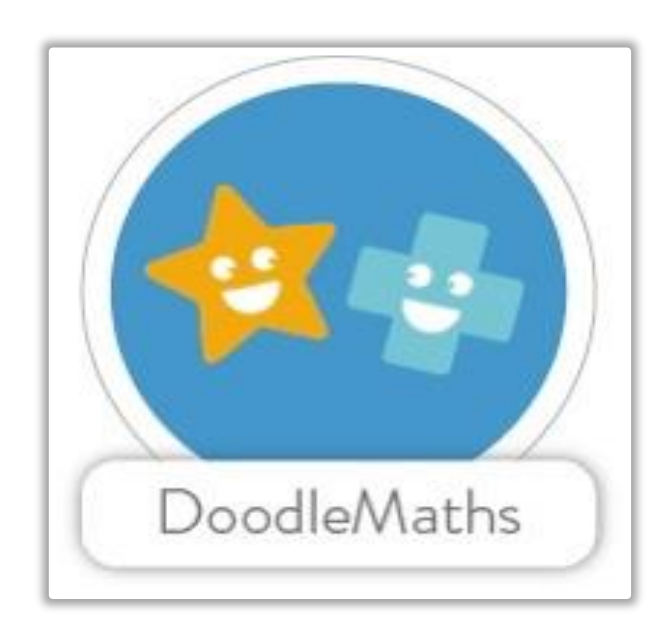
Our school apps promote confidence with numbers