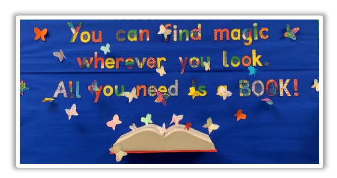
You can help by encouraging that 'love of reading'

At KEPS we believe in learning , growing & achieving together... there is no better time than now to show this as a community.