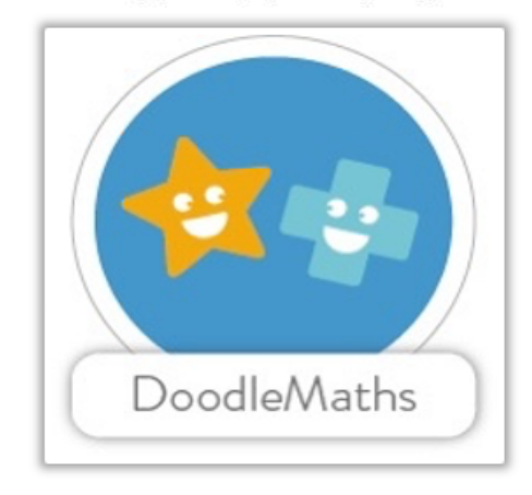
Our school apps promote confidence with numbers